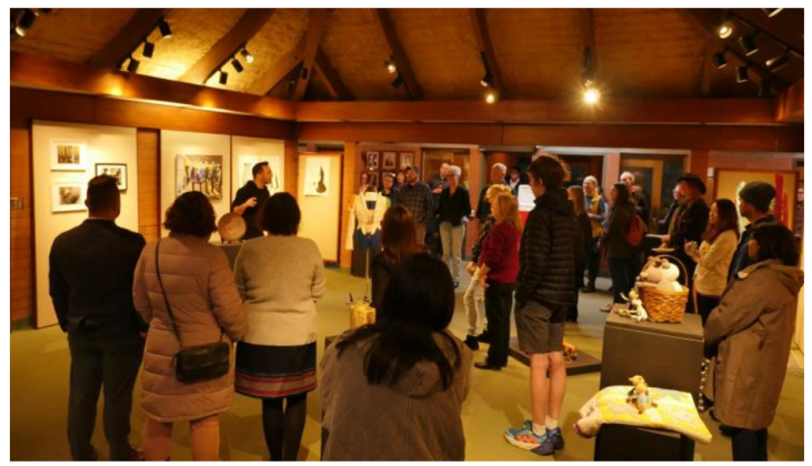
(re) UNITED (Shoreline Employee Art Exhibition): Artists' Reception!